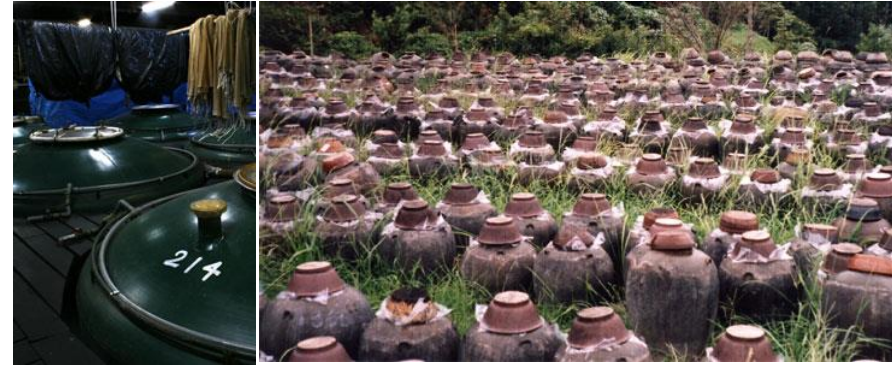
Functionalities produced by fermentation