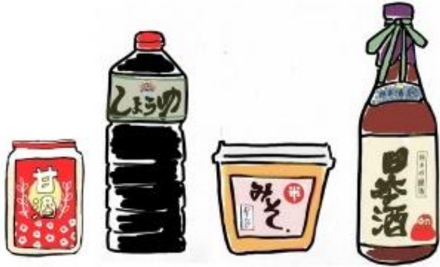
Traditional fermented foods = Slow food